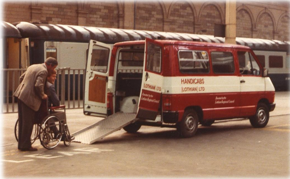
Passenger interchange at Waverley Railway Station 1982

“Just a little note to say thank you for the marvellous service which DIAL-A-BUS provides for old folk like me. The office staff and the bus drivers are always extremely helpful and I am indebted to you all. I thank you once again for your kindness.”