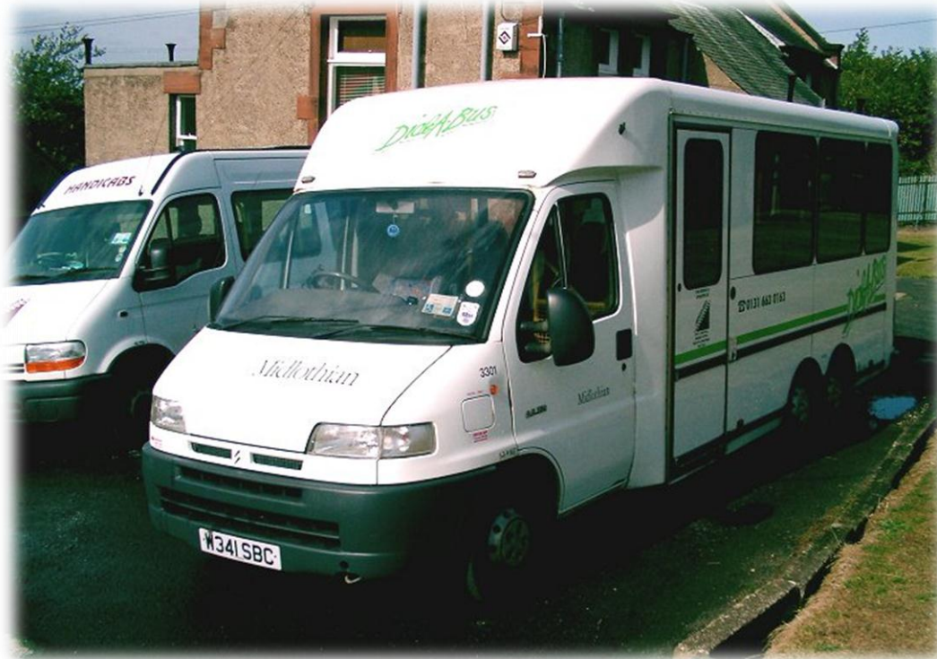
Dial-a-Bus and Handicab from 2002 at the now closed Dalkeith Base

Dial-a-Bus provides a Monday - Friday shopping service to local major shopping centres for people who have difficulty shopping using public transport. 3% of passengers use wheelchairs. All areas of Lothian have at least one and often two routes available during the week, either morning or afternoon. Edinburgh accounted for 55% of Dial-a-Bus passenger trips, West Lothian 31%, Midlothian 11% and East Lothian 3%.