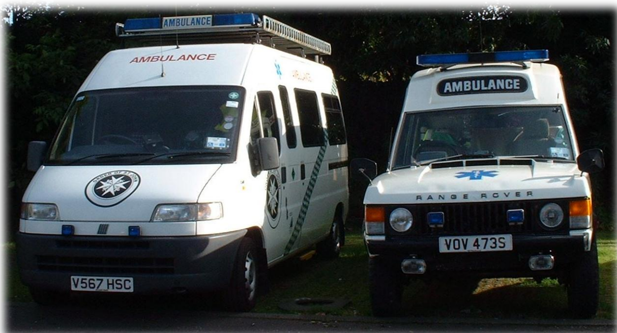
First HcL Ambulances in service 2005. 567 was donated by The Order of St John

Ambulance operates on an availability basis 7 days a week to provide ambulance services for the NHS and event cover. Stretcher, wheelchair and ambulant patients are able to be carried with specialist equipment available as required. Oncology and transfer patients make up the bulk of our current workload. 683 stretcher, 997 wheelchair and 2,209 ambulant patients were transported.