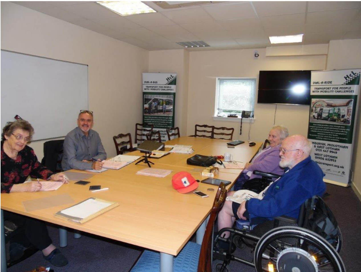
Boardroom at Bilston Glen