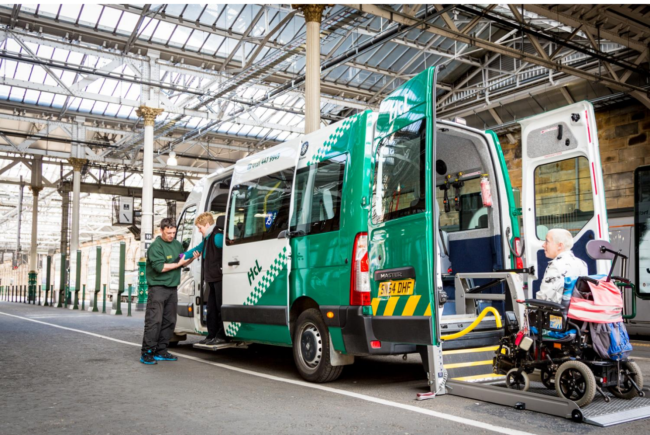
HcL vehicle at refurbished Waverley Station