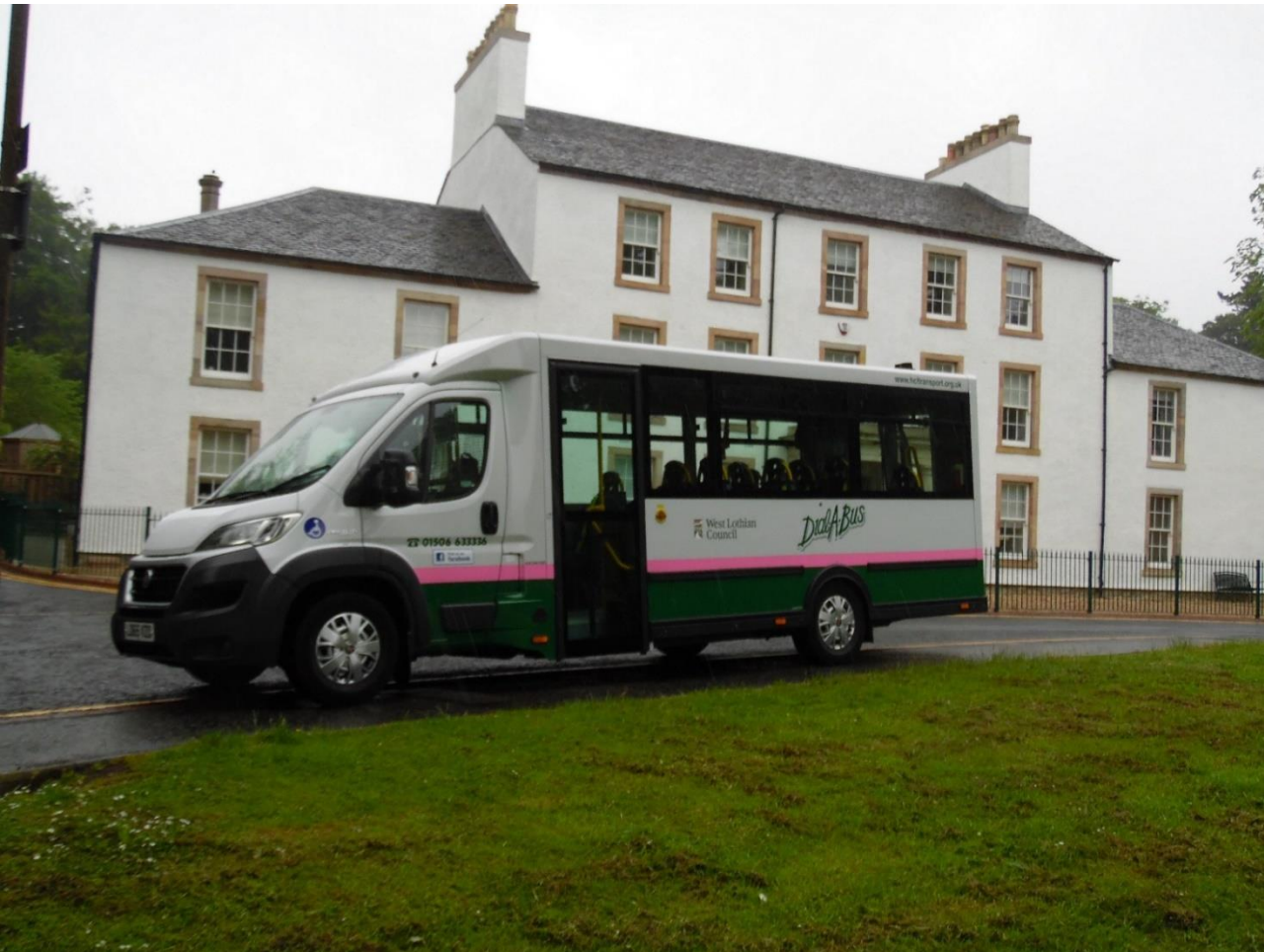
New West Lothian Dial-a-Bus