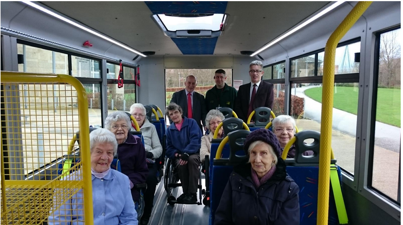
West Lothian Dial-a-Bus vehicle handover