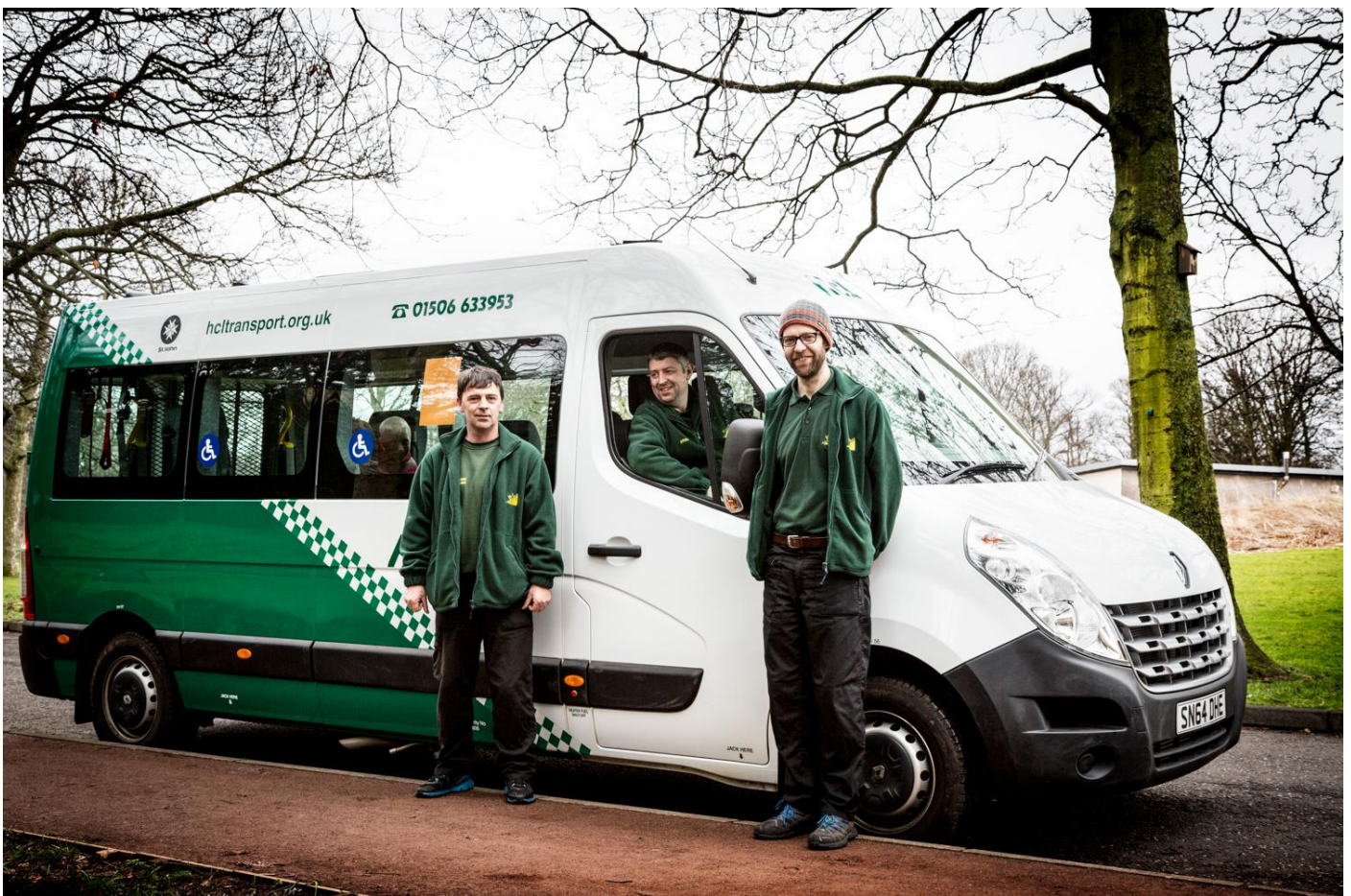
HcL staff with new vehicle