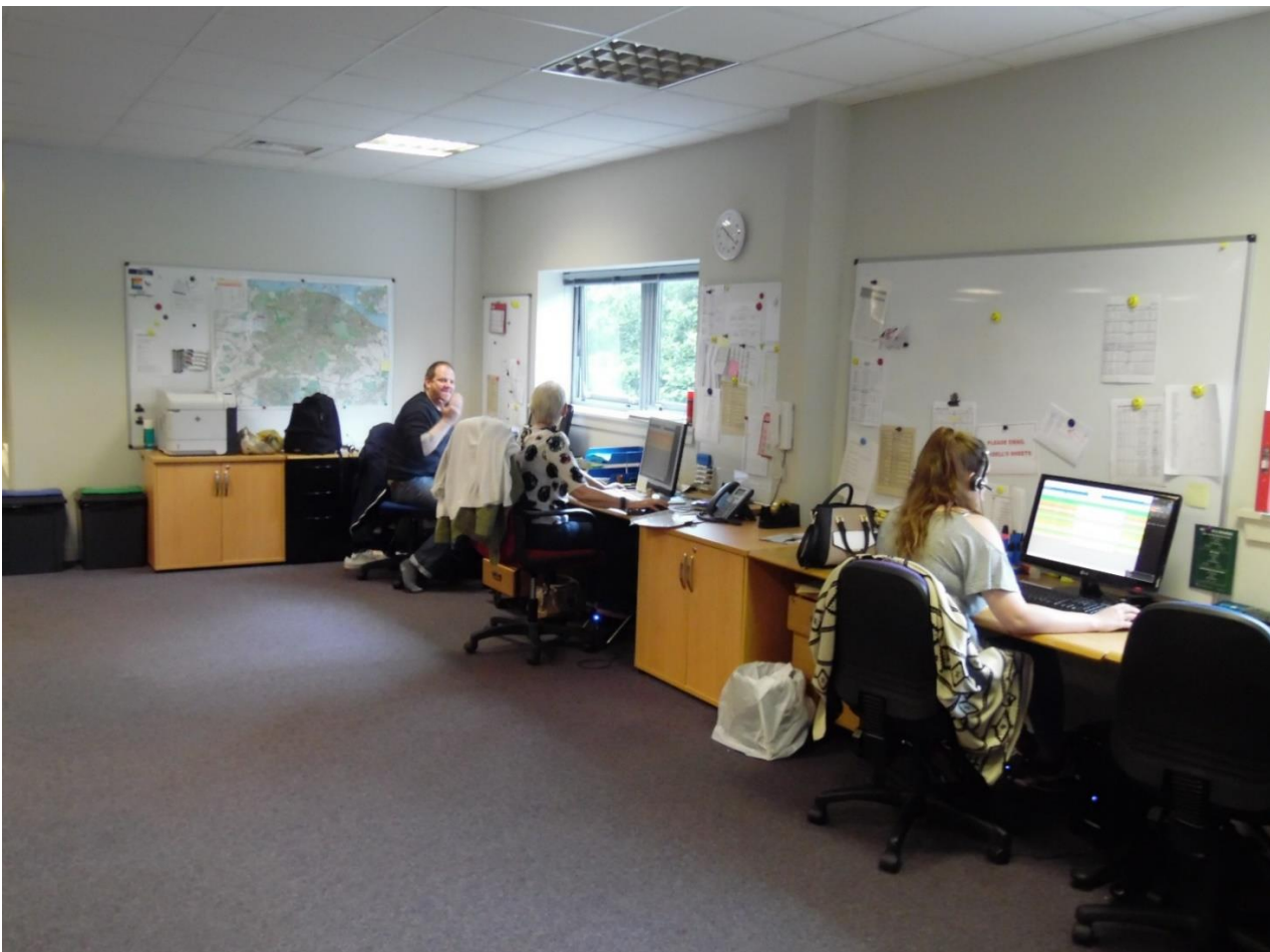
Despatch Office at Bilston Glen