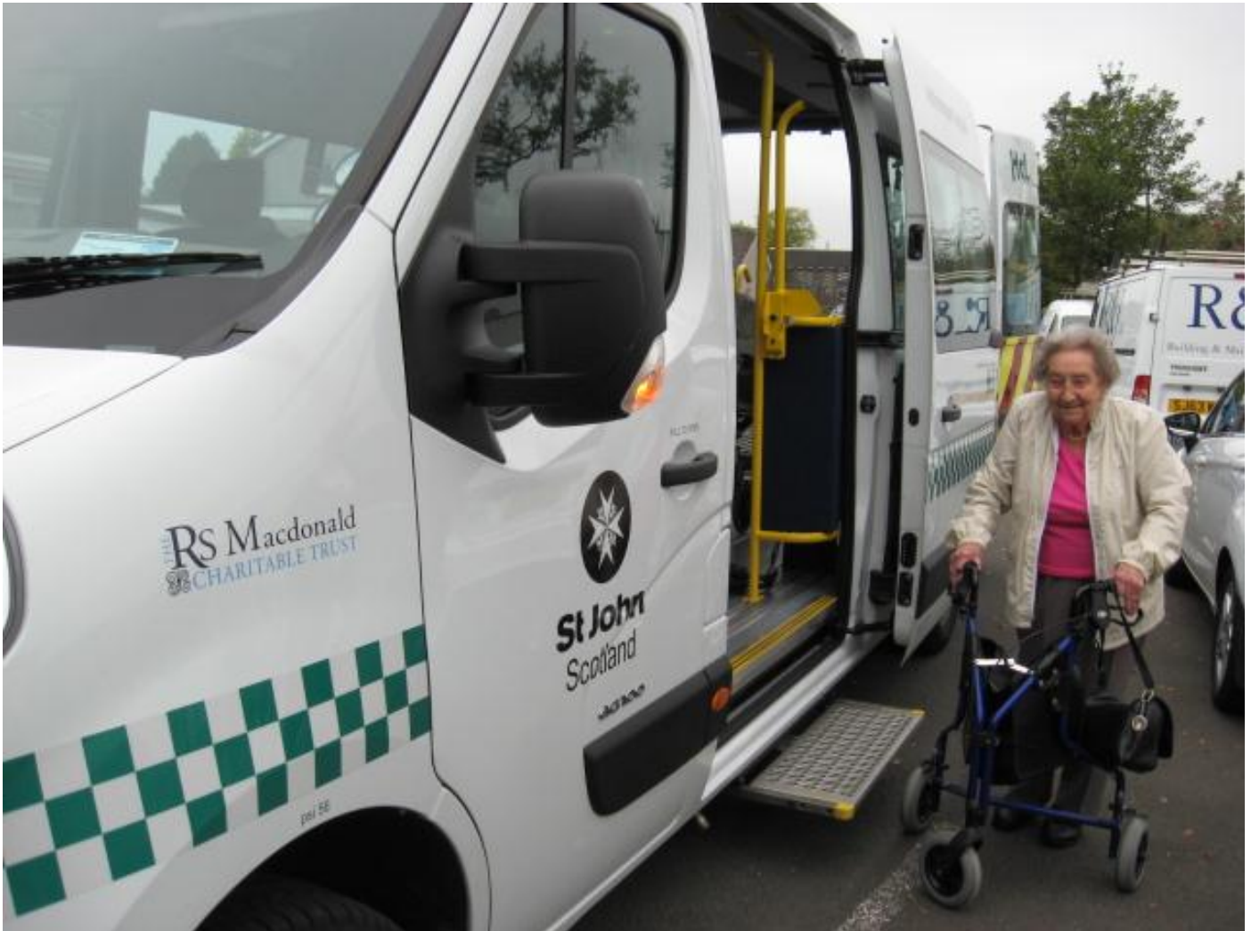
West Lothian passenger entering new vehicle. Funded by RS Macdonald charitable trust & Robertson Trust

Financially the net incoming resources for the year amounted to £147,711 compared to a surplus of £119,810 in 2013. A fundraising group continues to write to trusts and funders seeking support for our work and replacement vehicles.